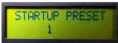
STARTUP PRESET Sets the preset that will be loaded at startup.

The three photos above show 3 positions of 16 used to set the name of the preset. In the three photos characters in position 1,2 and 3 are been set. In each of the photos the cursor is under the character been set. Rotating the right rotary encoder will change the character above the cursor.