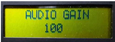
AUDIO GAIN Audio input gain